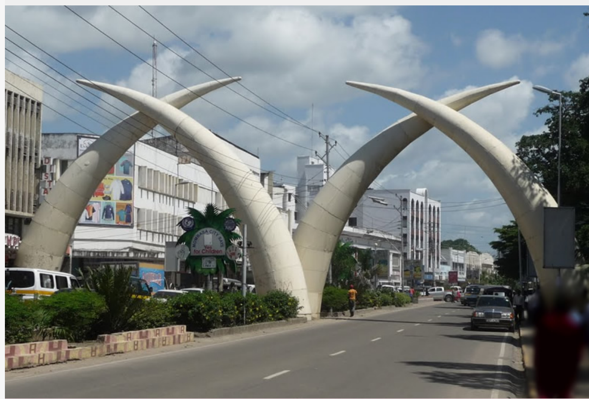
Greetings from Mombasa, Kenya! We would like to update you on what the HOPE Project has been up to in the past few months.